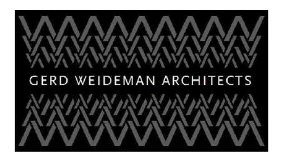
FINISHES SPECIFICATION 33 MEDBURN ROAD, CAMPS BAY